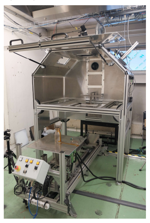
Figure 3 - FIRE facility

As previously mentioned, the impacted panels have been tested on the FIRE test bench (see Figure 2).